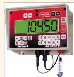
EZ 3500 with datakey, docking station and software as an option.

A rapid and homogeneous TMR mixing process. Optimum angle of inclination of the flights for an acceptable power requirement. Planetary drive system.