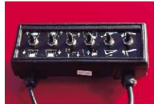
Electric operation as an option.