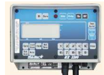
Programmable weighing computer for PC or printer as an option.