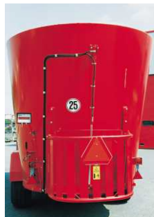
A discharge door at the back of the machine as an option.

Correct height of the mixing auger in proportion to the height of the mixing chamber.